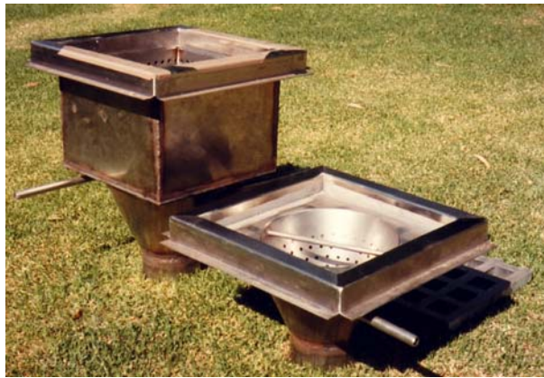
TYPE A—EXTENDED SUMP

* Nominate flushing or non-flushing type